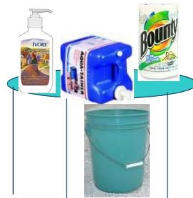
Hand Washing Station